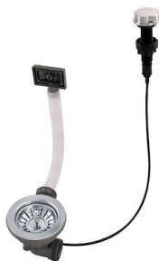
Automatic waste fitting 8407 100